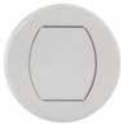
Powder Coated White