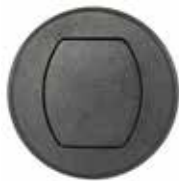
Powder Coated Black